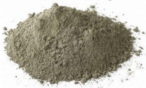
Figure 1: Visual Representation of Typical Cement